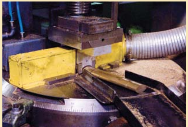
▲ One of the first production steps is cutting the lock body to length from an extruded brass bar. This saw was built in-house specifically for this operation.

Key barrels and bolt locks, which go into the lock body, are turned, drilled and broached. From the machining floor, these traceable parts go to assembly as a set.