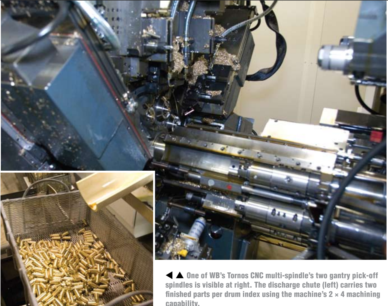
◀ ▲ One of WB's Tornos CNC multi-spindle's two gantry pick-off spindles is visible at right. The discharge chute (left) carries two finished parts per drum index using the machine's 2 × 4 machining capability.

our continuing search to find better ways of making our products competitively.”